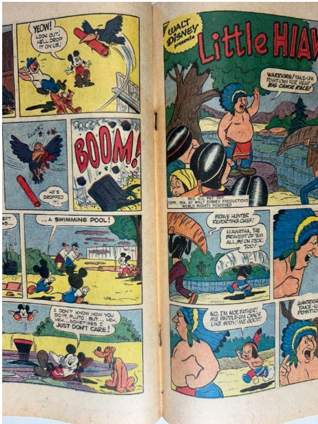
Image is in focus and evenly lit, clearly showing both pages and the central gutter.