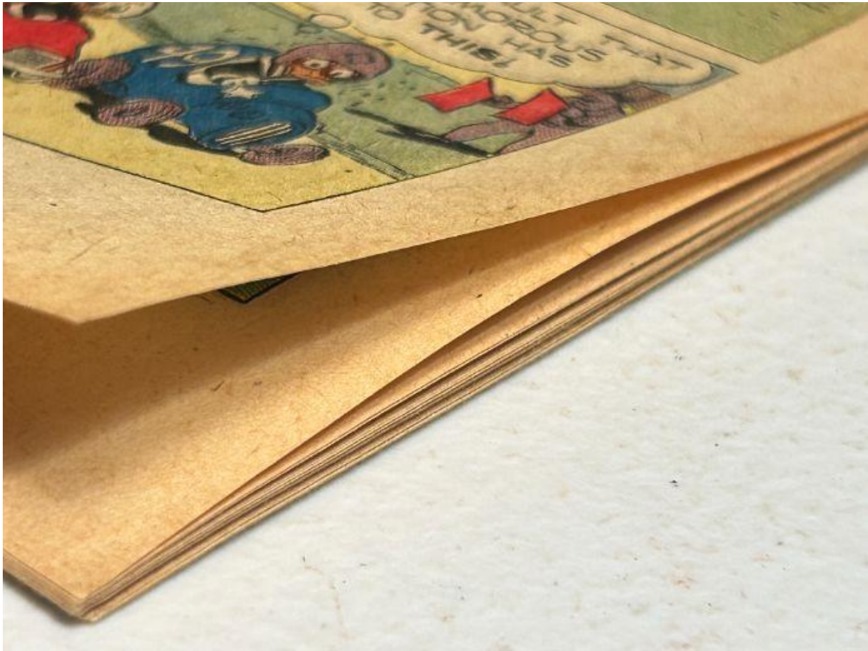
Image shows a single interior page lifted above flat underlying pages.