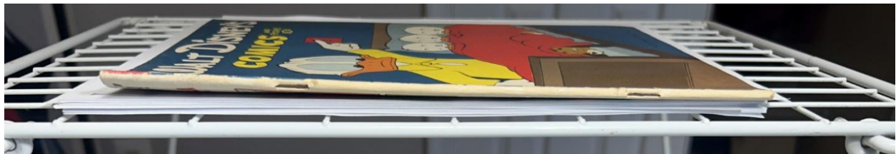
Image is sharp and well lit, showing the full spine length.